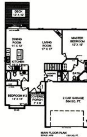
MAIN FLOOR PLAN SCALE: 1/8" = 1'-0"

Tile entry 2 Bedrooms 2 Full bathrooms w/ Mannington vinyl flooring Main floor laundry w/ Mannington vinyl flooring Dining room 11' X 12' Master bedroom 13' X 15' w/ walk in closet Master bathroom his & her sinks 5' walk in shower with seats 60" x 60" corner Caribbean jetted tub # 2 Bedroom 11' X 11' Kitchen w/ country oak cabinets & Formica tops Kitchen & dining Shaw laminate flooring Living room 17' X 17' Interior doors six panel painted Oak base and casing Lennox gas fireplace w/ tile & oak mantel 90% Trane furnace Trane central air Sherwin Williams / Diamond Vogel paint Knockdown texture 85 gal. Electric Marathon water heater 2 Frost free water spickets 2 x 6 Exterior walls w/ 9' main floor walls Blown-in fiberglass insulation R-22 walls R-38 ceilings