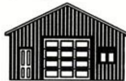
24' X 30' SHOP SCALE: NTS